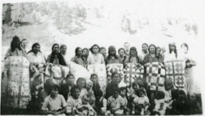
Ladies with quilts made at the Mission.

This photo is to be published in a book on quilts and quilters of Montana that the State Historical Society is currently working on.