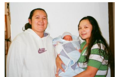
Here are just a few of the recipients of our layettes.

Whenever possible, we have used the wonderful fleece baby blankets many of you have sent to wrap the layette items in. We are going to start using "gift" bags also for this.